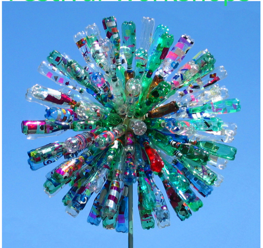
Dandelion made from 200 fizzy drinks bottles