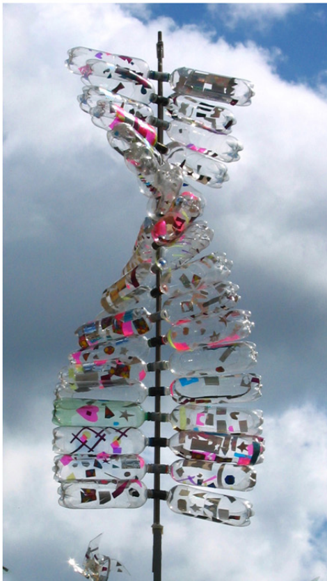
Spiral made from 36 bottles