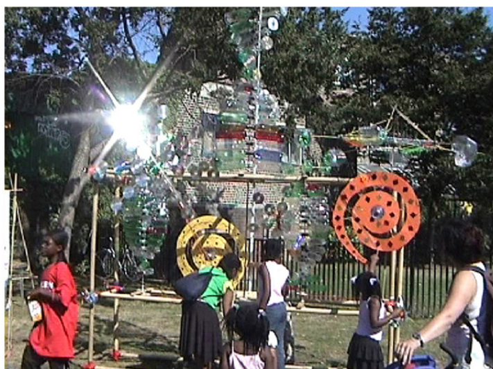
Kilburn Festival 2007