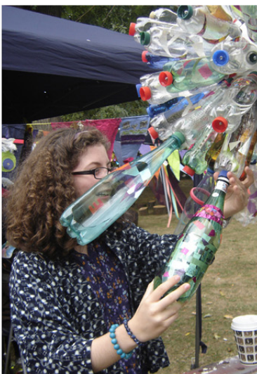
Queens Park Day 2009

Bookings: Molly or Tom: phone 020 8969 6409, 020 7328 2782 info@artsrepublic.co.uk